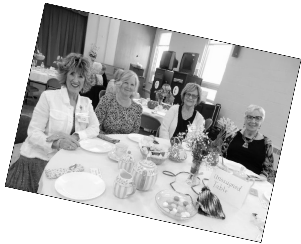
Ladies enjoying the event