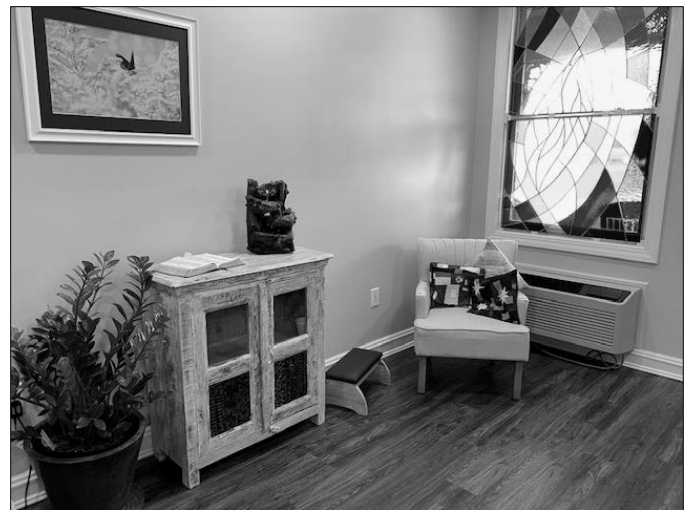
Otterbein Reflection Room